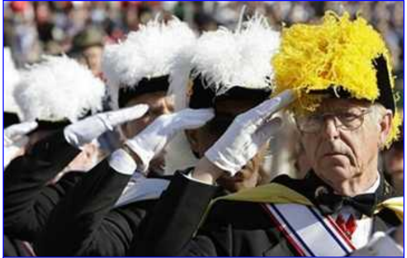
Proud Honor Guard for Pope Benedict

Reprinted excerpts with permission of the Ohio State Alumni Association Buckeye Bulletin - courtesy of K of C Brookside Council #3297, Cleveland