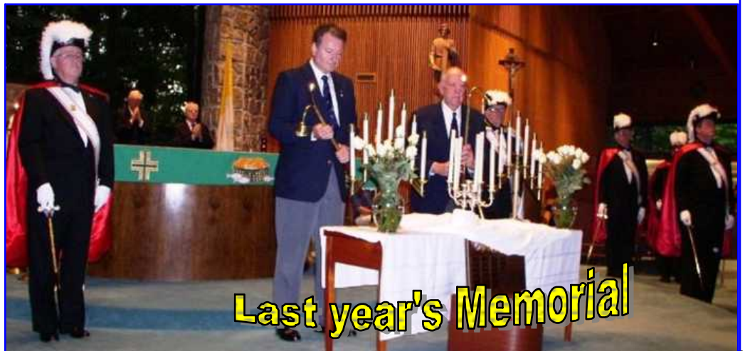
Last year's Memorial

Bring the family to view this very moving tribute.