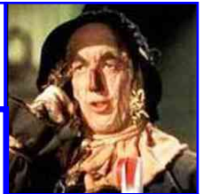
1939 winner of Council “ Brainy Brother ” Award

Trivia Question for August 1st Meeting: What recording artist or group has sold more recordings than any other recording artist or group in music history?