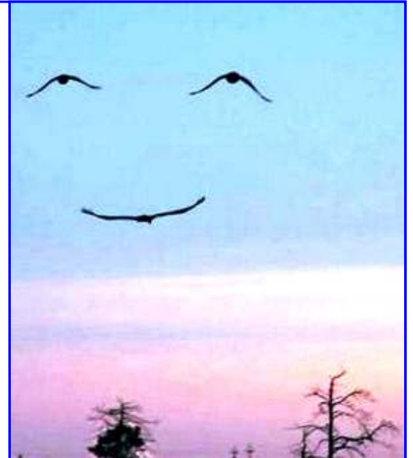
A Smile from God