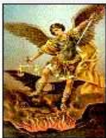
St. Michael the Archangel

St. Michael the Archangel, defend us in battle; be our safeguard against the wickedness and snares of the devil. May God rebuke him, we humbly pray. And do you, O prince of the heavenly host, by the power of God, cast into Hell Satan and all the evil spirits who prowl about the world seeking the ruin of souls. Amen.