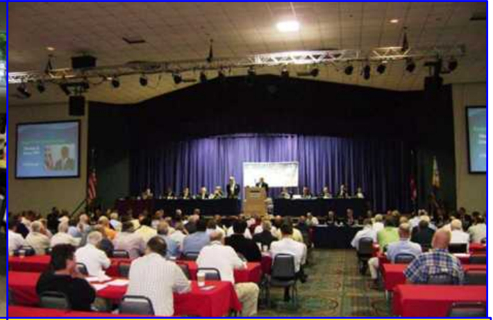
Grand Knights, Past Grand Knights, District Deputies, and various State Officers met in mid-May at Jekyll Island to chart the future course of the Order in Georgia and elect new state officers for the coming fiscal year.