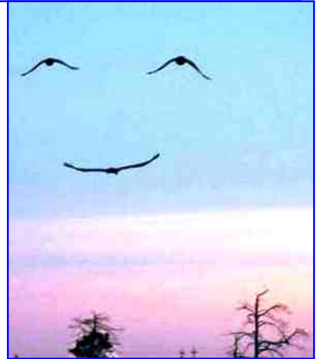
A Smile from God