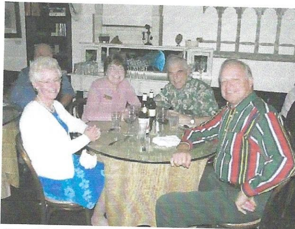
Date Night, the KofC way. Note the high quality name tag

This last dinner was very enjoyable; with 30 diners taking advantage of the low cost ($20/person) gourmet meal, and almost everyone brought their own favorite bottle of wine to enjoy with their meals. The menu was