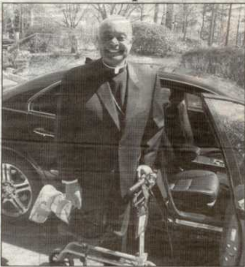
Catholic Archbishop Wilton Gregory has a new nickname, "Scooter." After tearing his Achilles' tendon in a racquetball game, he is using the new apparatus to coast around town. He drew appreciative laughter Saturday when he scooted down the church aisle in full vestments at All Saints Catholic Church's confirmation service.

Atlanta Archbishop Wilton Gregory was an awfully good sport and one tough cookie when he wheeled into the All Saints parking lot with a bad right leg.