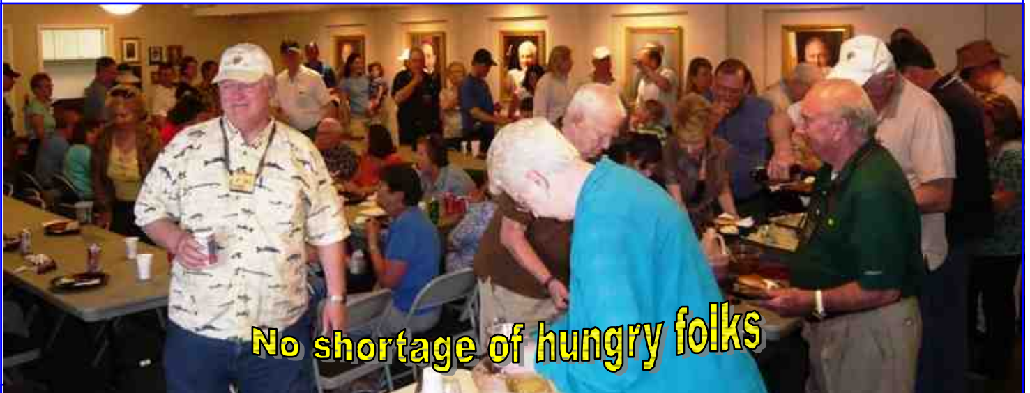
No shortage of hungry folks

Thanks to all the folks that made our 2010 Fish Fry another record event. Not a fish seen here, though.