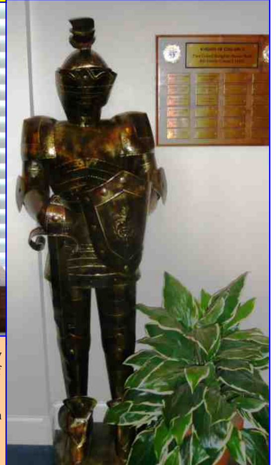
A golden Sir Knight suddenly appeared in our hall a few weeks ago. The origin is unknown, but the figure lends majesty to McGivney Hall.

It will form a bookend with our other such award for construction of Our Lady, Queen of the Knights Chapel at the rear of All Saints Church. We may be the only council with two such prestigious awards.