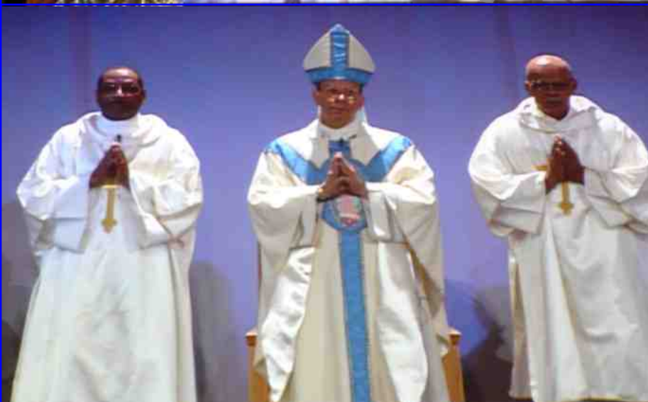
Supreme KofC Chaplain Bishop William Lori of New Haven celebrates Mass at the 128th Annual Supreme Convention in the Basilica of the Immaculate Conception in Washington DC.

It was just a typical Tuesday morning Mass at the Basilica of the Immaculate Conception. About 200 honor guard in all manner of colored chapeaus lead a procession that preceded 100 priests, followed by 100 bishops and archbishops, followed by 8 cardinals, followed by the celebrant with large shepherd staff. Typical morning Mass.