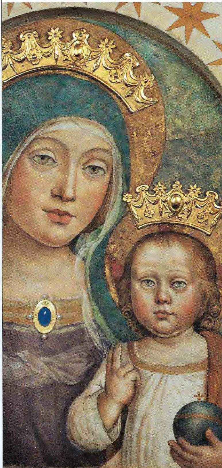
The ancient fresco of the Madonna del Soccorso (Our Lady of Help) in St. Peter's Basilica was restored with the support of the Knights of Columbus to mark the Year of Faith (2012-2013).

O Mary, you always brighten our path as a sign of salvation and of hope. We entrust ourselves to you, Health of the Sick, who, at the Cross, took part in Jesus' pain while remaining steadfast in faith.