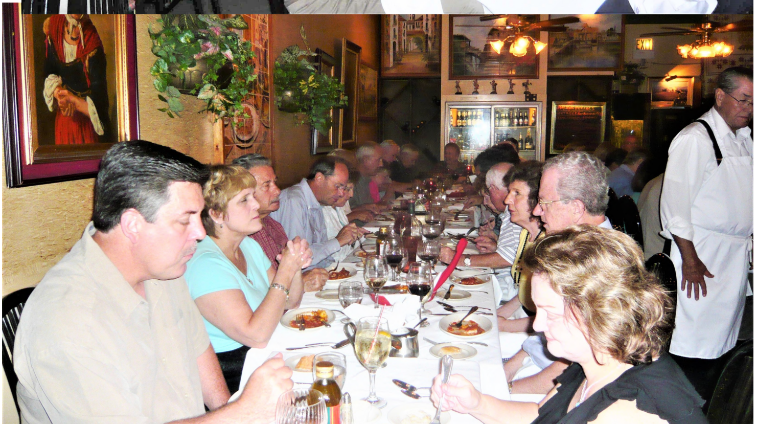
Oscars Restaurant Council Dinner 2016-06-14