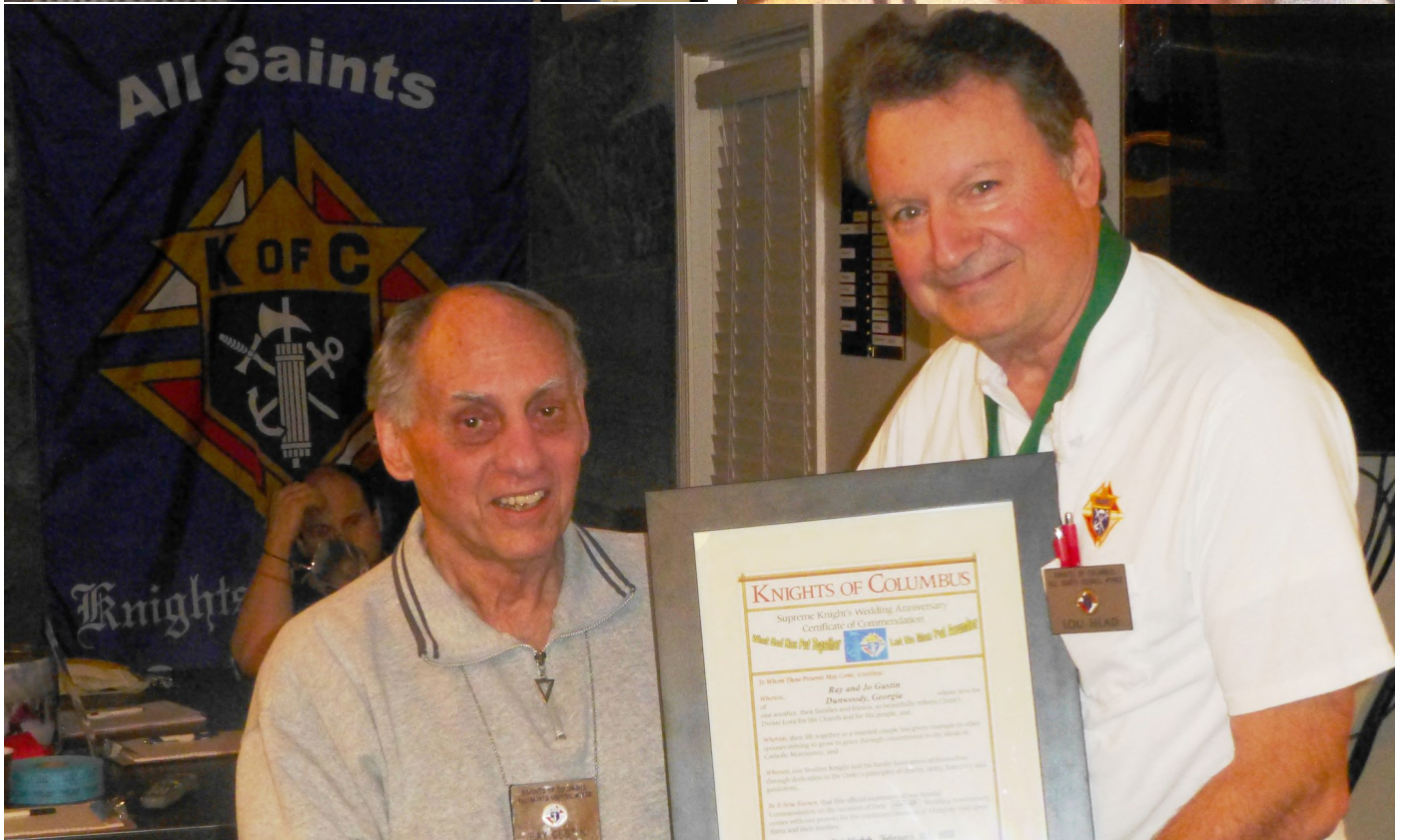
60 years of marriage award 2013.