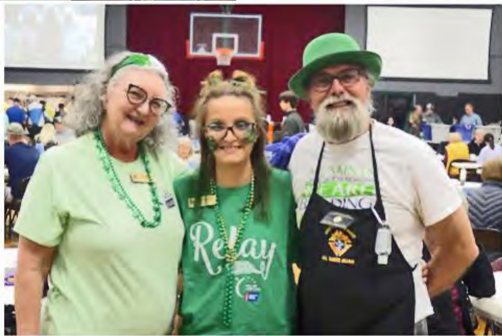
The Driscolls go totally green