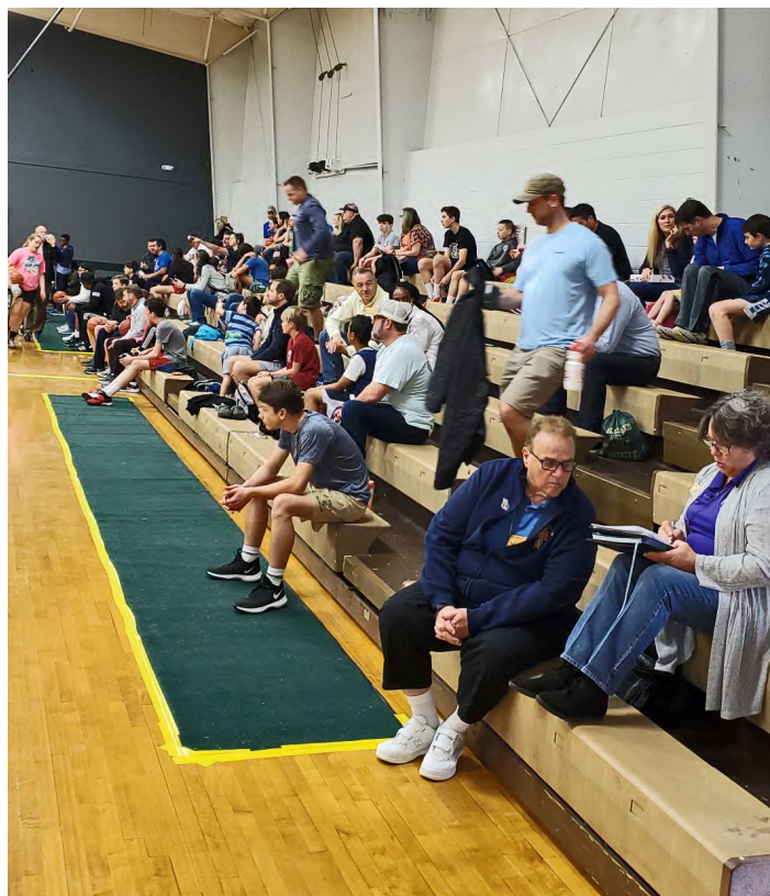
The grandstand is packed with spectators from all over Georgia every year. Too bad we don't sell tickets.