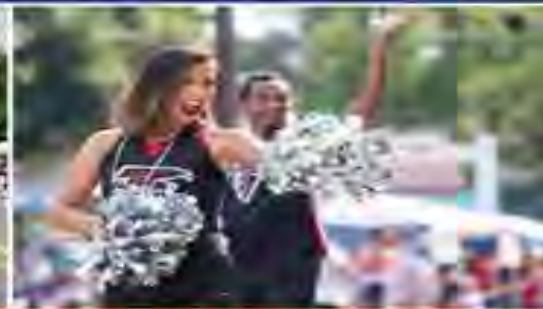
Dunwoody's 4th of July parade | Mt. Vernon Road to Dunwoody Village | 9 a.m.

Georgia's largest July 4th parade is right here in Dunwoody! Coordinated by the Dunwoody Homeowners Association, the Dunwoody parade is a long-standing tradition. Bring your lawn chairs and set up at any point along Dunwoody Village Parkway or Mt. Vernon Road or beginning at Jett Ferry Road. The parade steps off at 9 a.m. Post-parade activities, including music, food and kids activities, begin immediately following in Dunwoody Village. Learn more