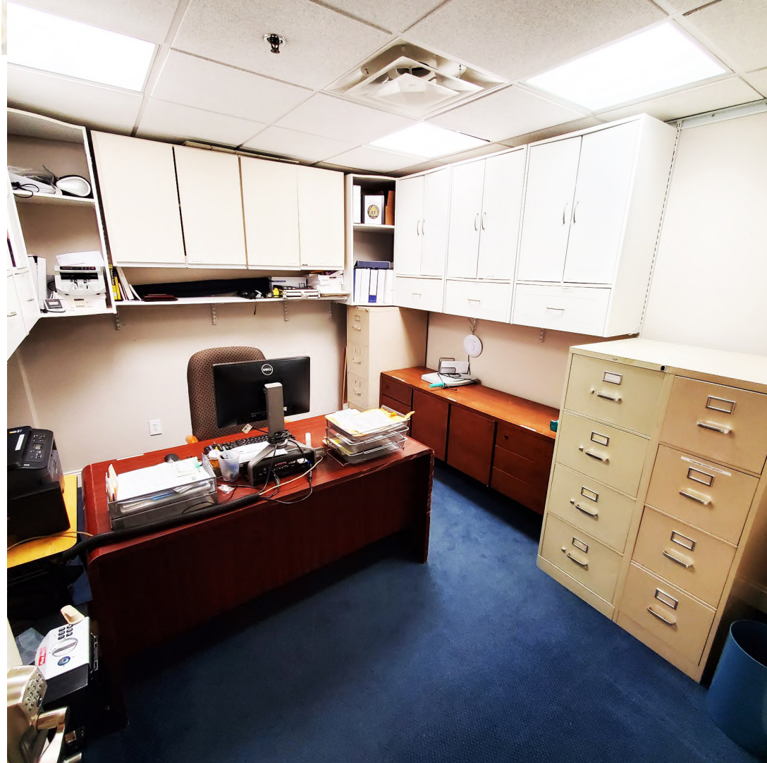
Financial Secretary Office Completely cleaned out and rearranged