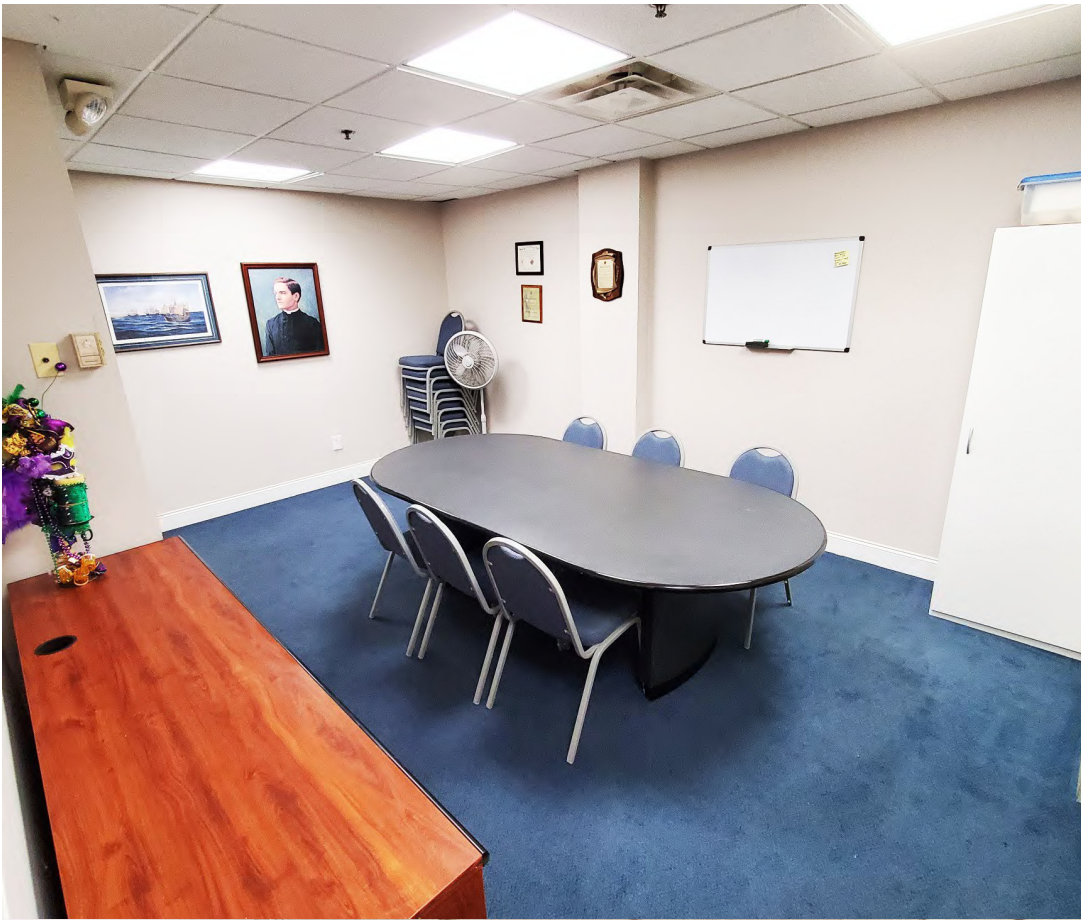
Conference Room Ready for a meeting