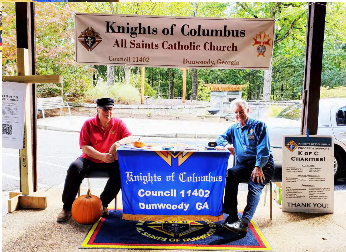
Signers and brochure handlers