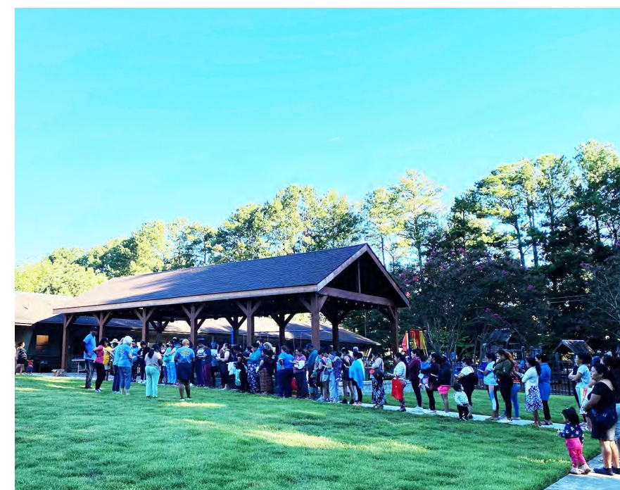
The needy in queue