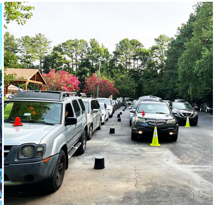
The packed parking lot