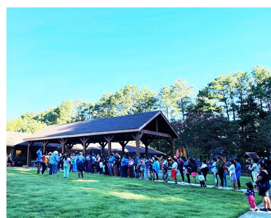
The needy in queue